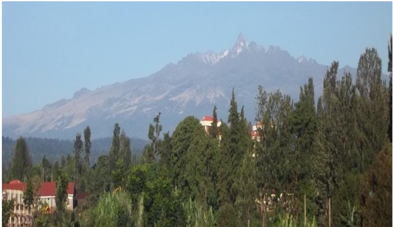
Chuka University is located near Mt. Kenya in the background